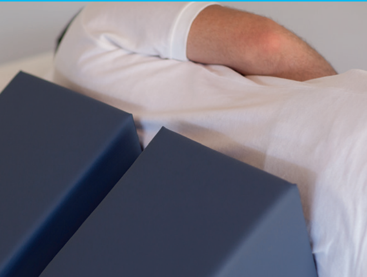
MODULAR SIDE LYING SUPPORT SYSTEM

Our devices are specifically designed to help restore symmetry, reduce secondary complications and optimise function.